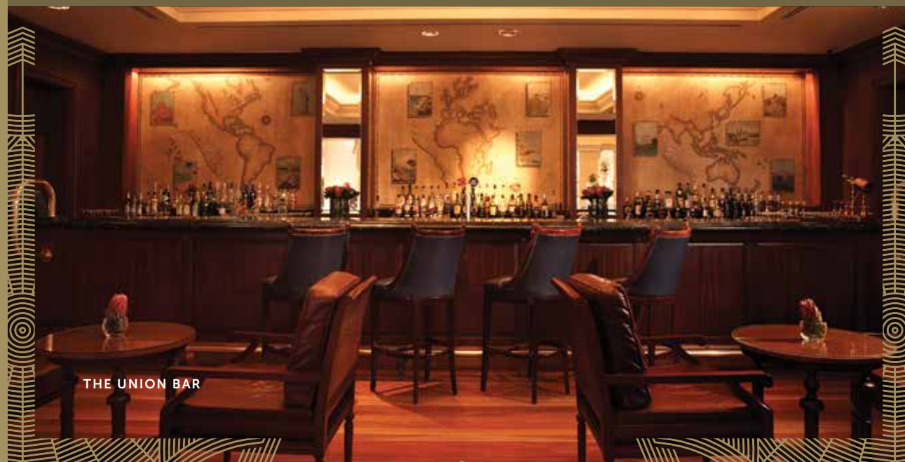
THE UNION BAR

The Union Bar is a classy destination, with sea-faring and shipping memorabilia dotting the plush, wood-paneled walls. Guests can sip fine wines and premium whiskeys from leather armchairs. And if the fine living gets too much, there's always a wide selection of sumptuous cocktails to enjoy.