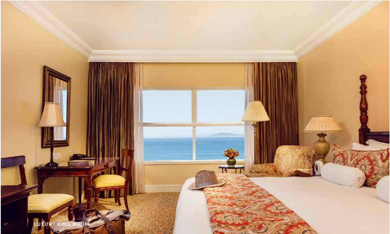
LUXURY KING ROOM