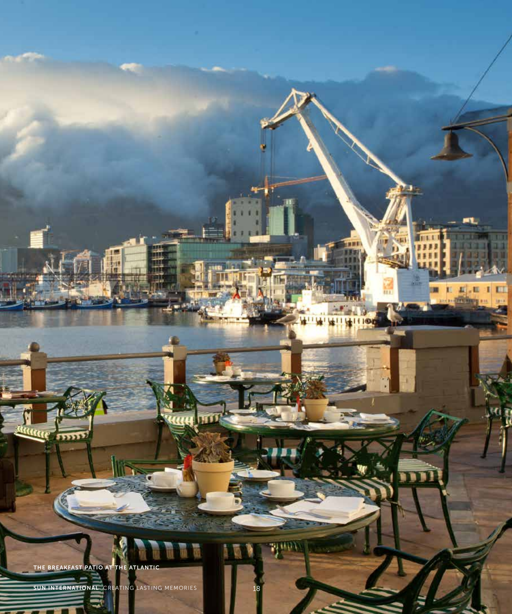
THE BREAKFAST PATIO AT THE ATLANTIC