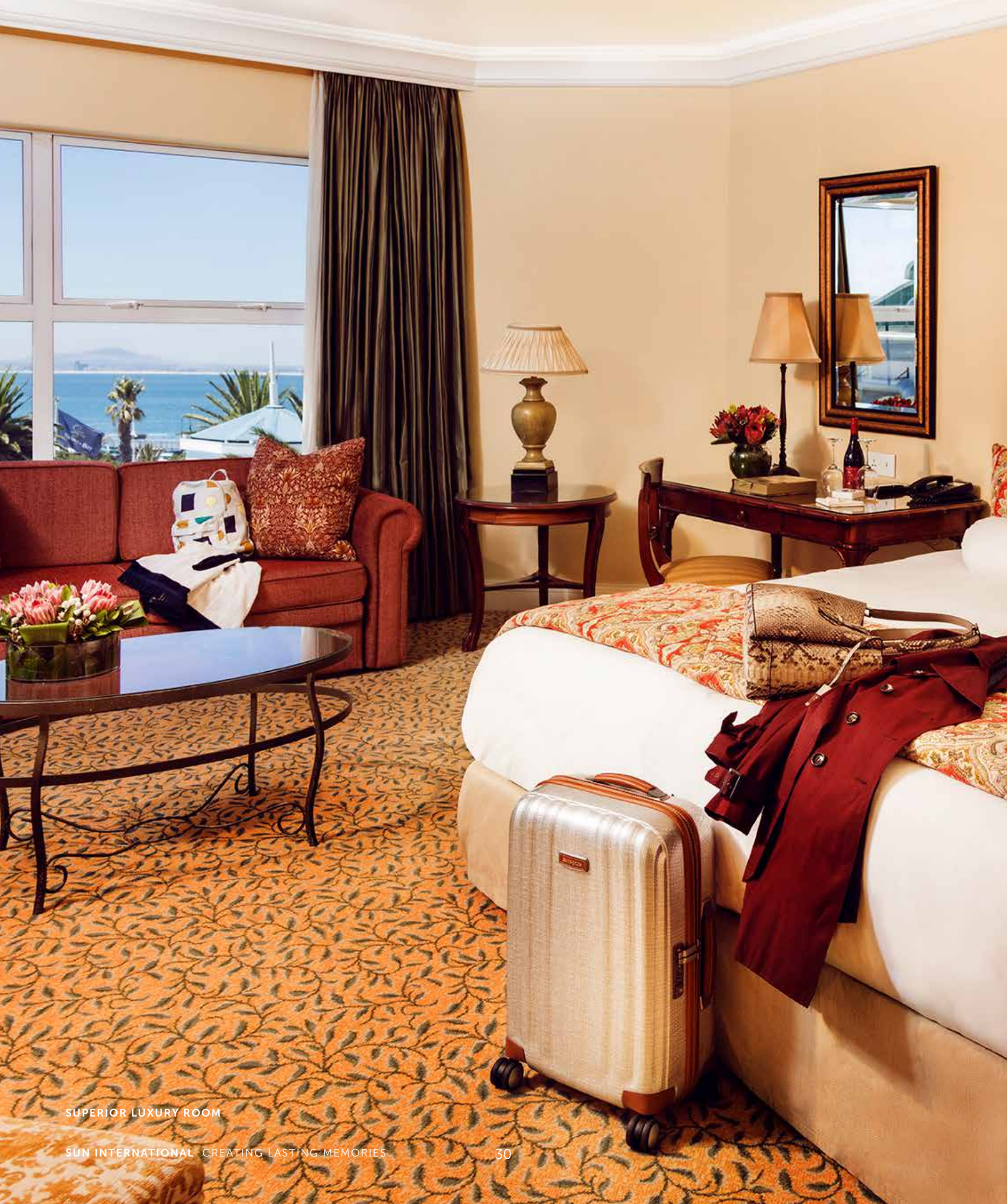
SUPERIOR LUXURY ROOM