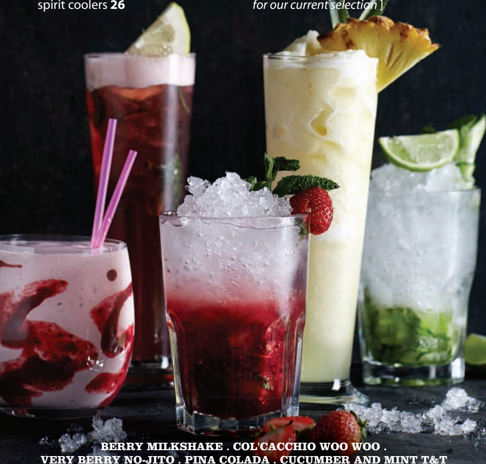
BERRY MILKSHAKE . COLCACCHIO WOO WOO . VERY BERRY NO-JITO . PINA COLADA . CUCUMBER AND MINT T&T

craft beers [please ask your waitron for our current selection]