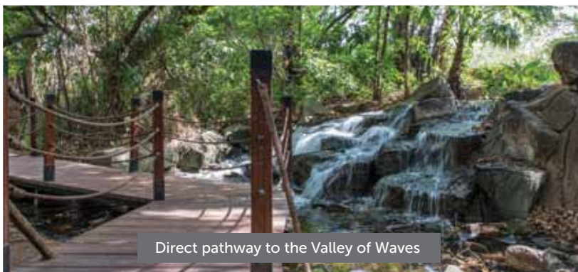
Direct pathway to the Valley of Waves