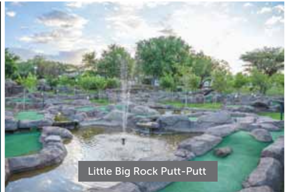
Little Big Rock Putt-Putt