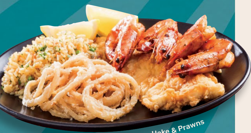
Hake & Prawns