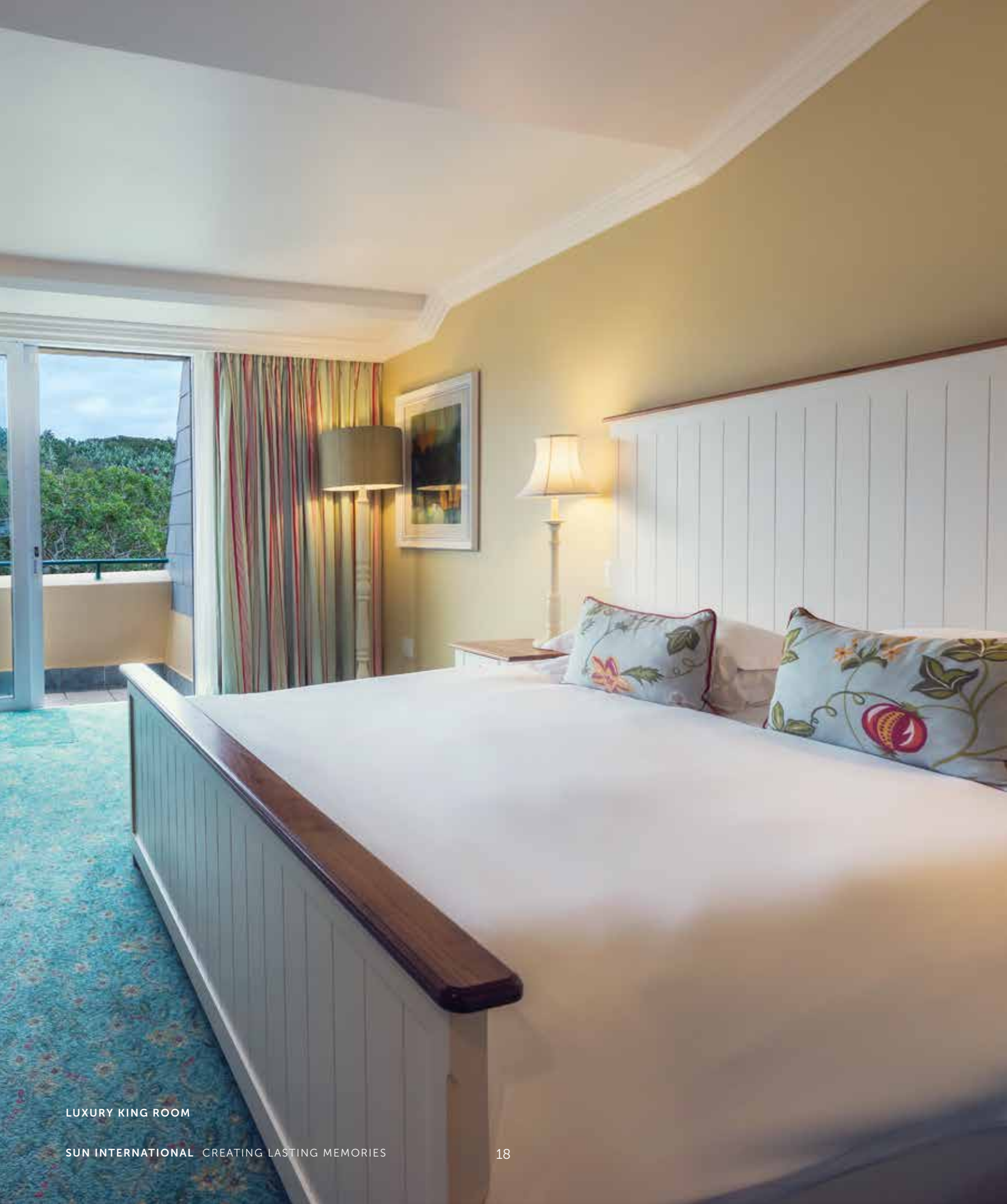
LUXURY KING ROOM