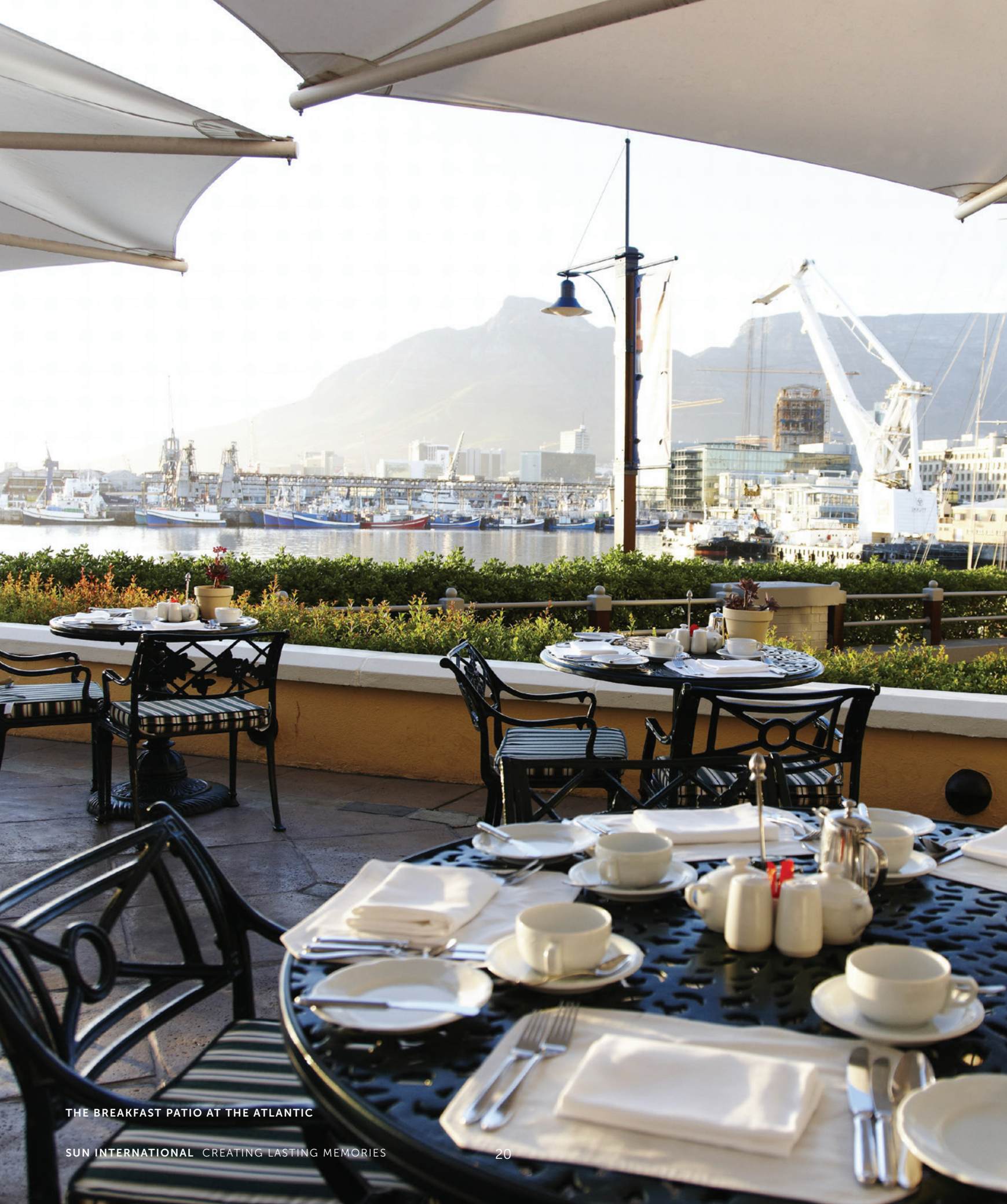
THE BREAKFAST PATIO AT THE ATLANTIC