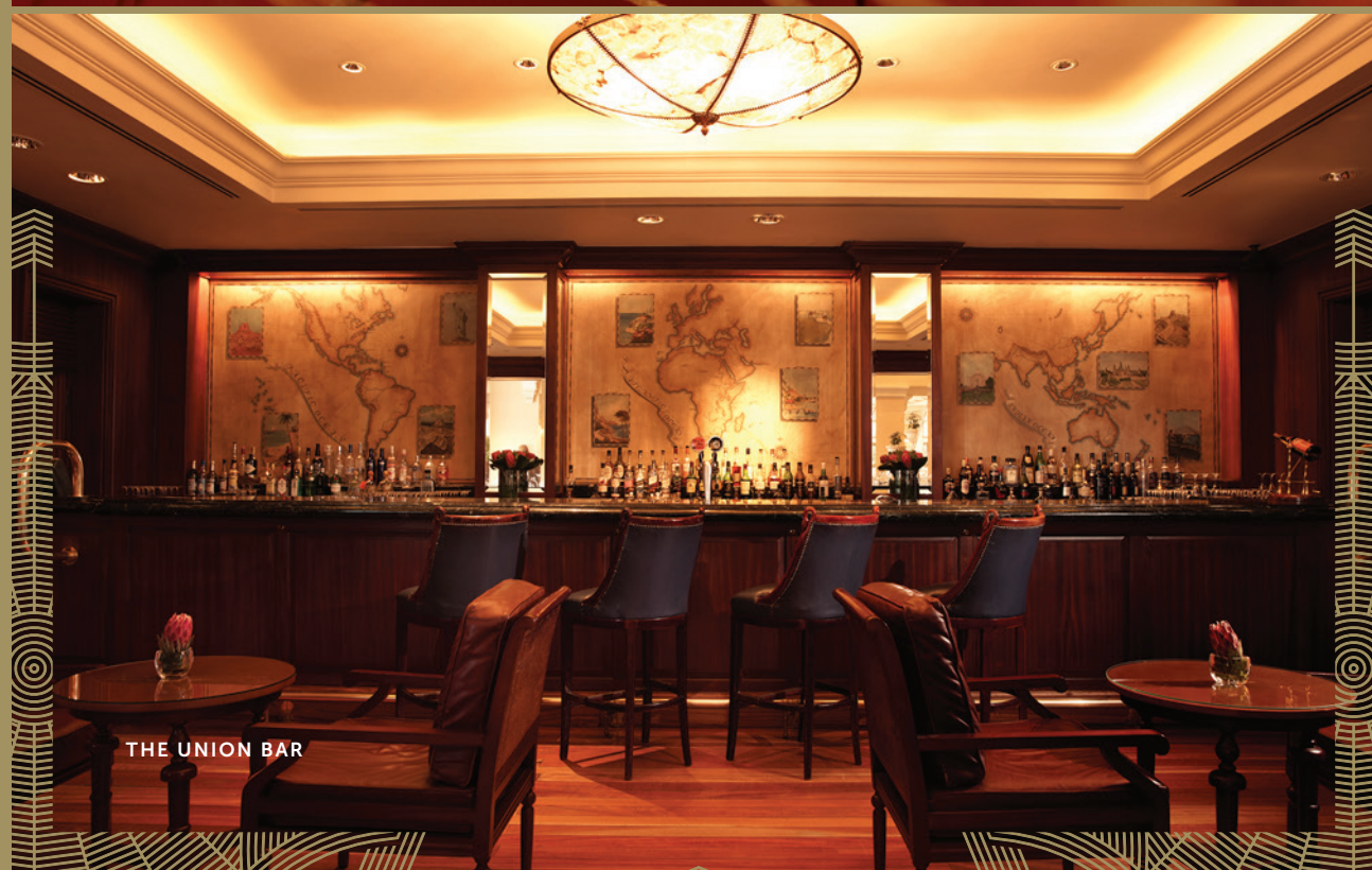
THE UNION BAR

The Union Bar is classy with sea-faring and shipping memorabilia dotting the plush, wood-panelled walls. This is where guests can sip fine wines and premium whiskies from leather armchairs. If fine living gets too much, there's always a wide selection of well-poured cocktails to enjoy.