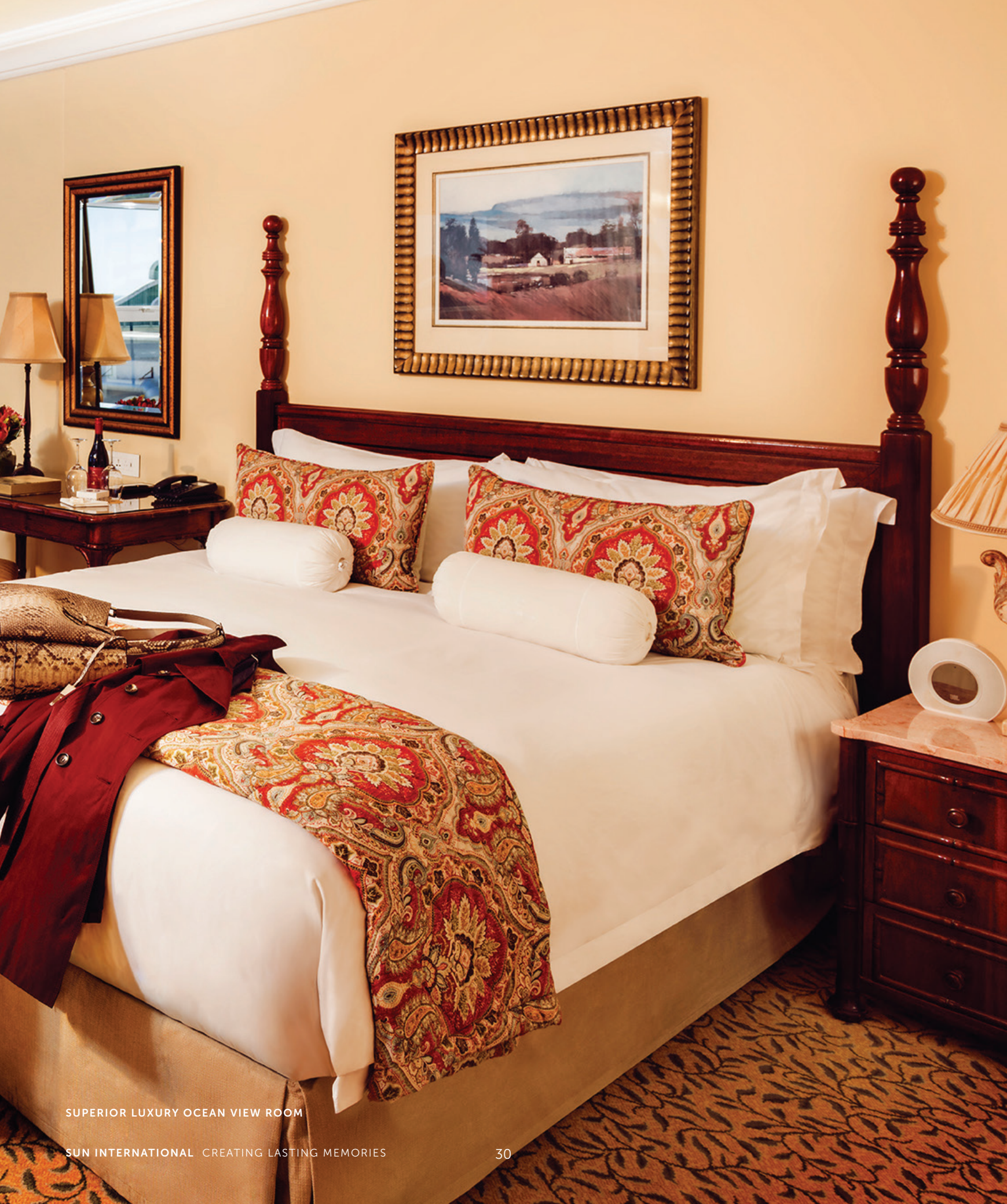
SUPERIOR LUXURY OCEAN VIEW ROOM