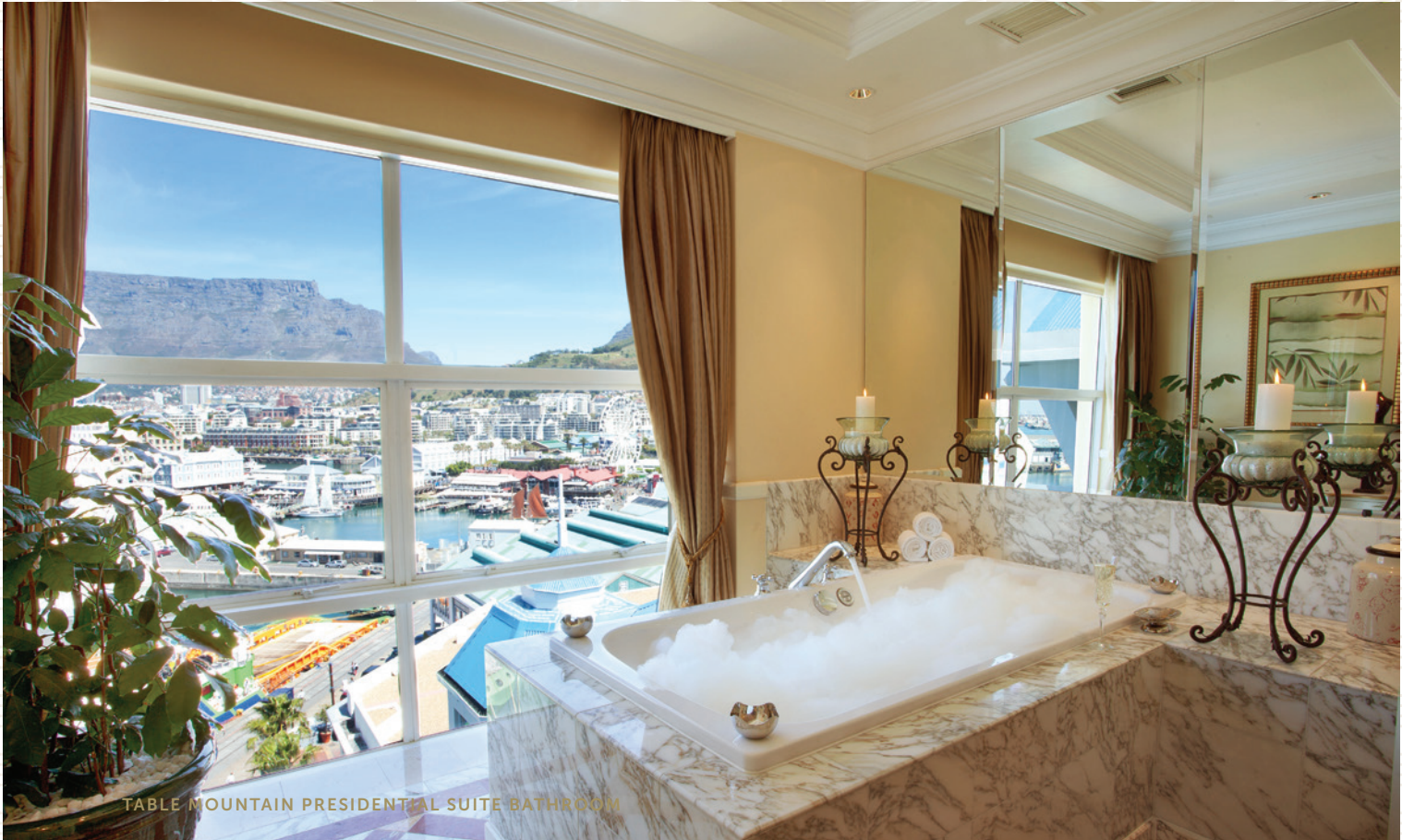
TABLE MOUNTAIN PRESIDENTIAL SUITE BATHROOM