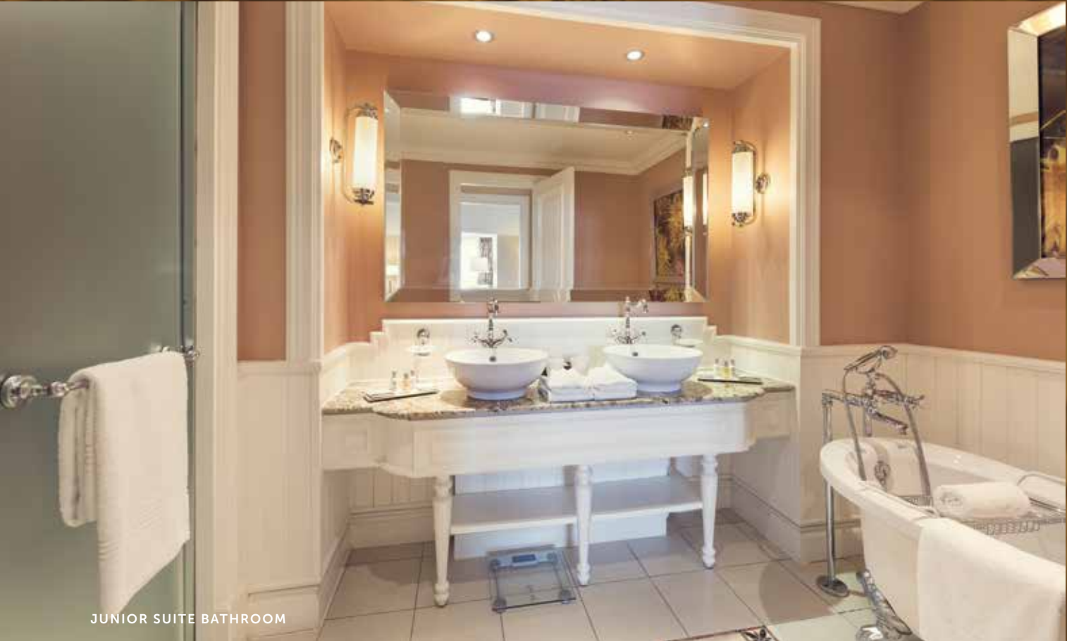
JUNIOR SUITE BATHROOM