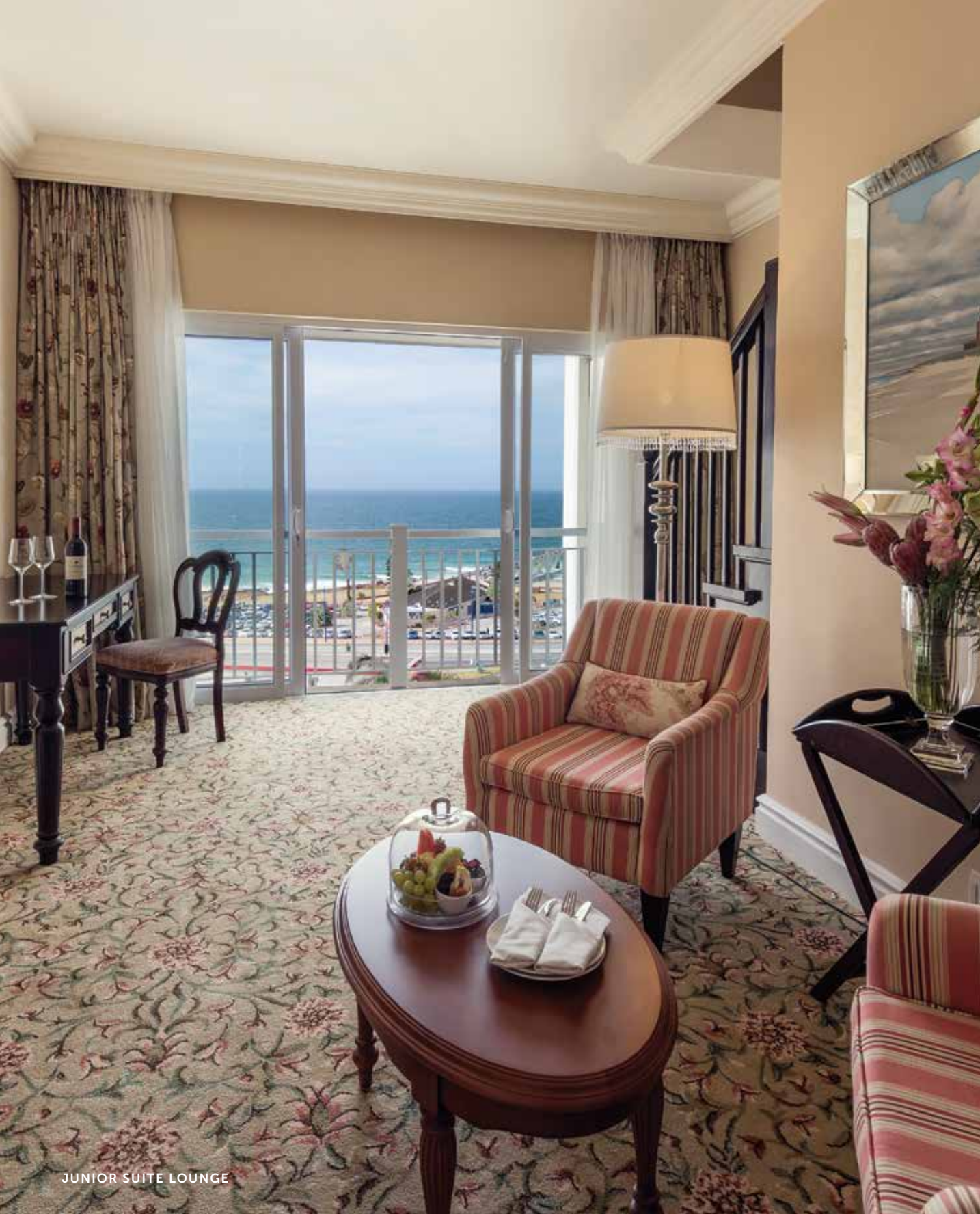
JUNIOR SUITE LOUNGE