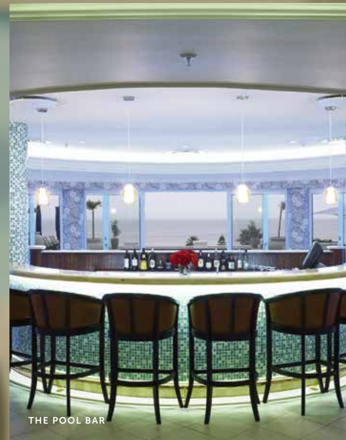
THE POOL BAR

Lounging next to the hotel outdoor pool offers guests the opportunity to escape the hustle and bustle of city life, savouring nature's finest whilst in one location. It's where one can soak up some sun, indulge in a delicious cocktail or doze off to the sound of crashing waves whilst deeply inhaling fresh ocean air.