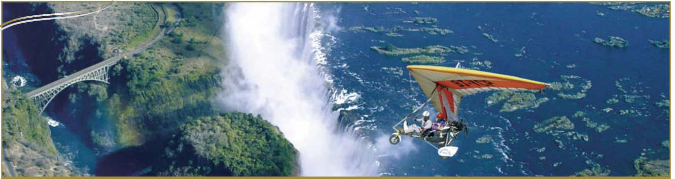
The Victoria Falls Zambia.