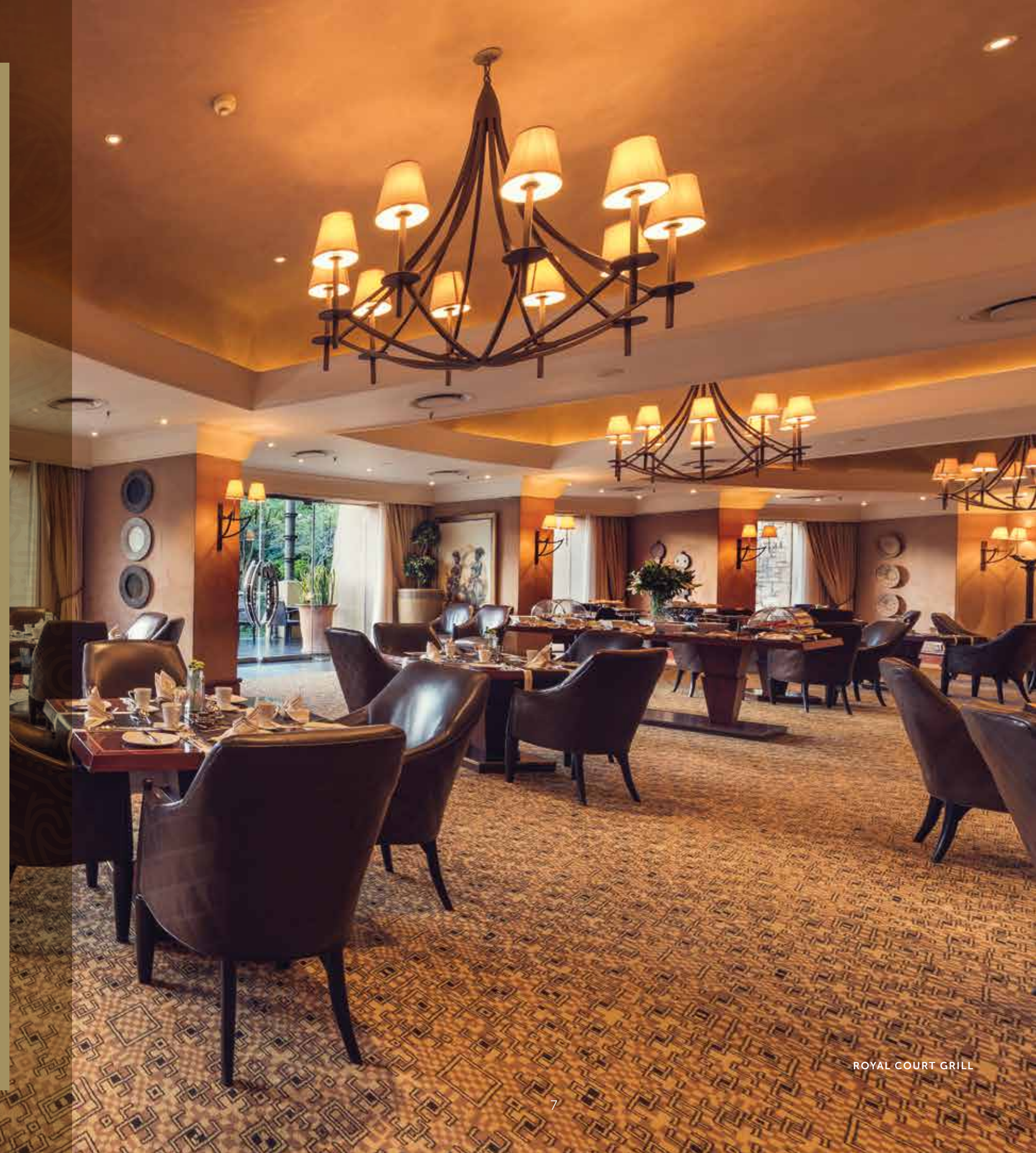
ROYAL COURT GRILL