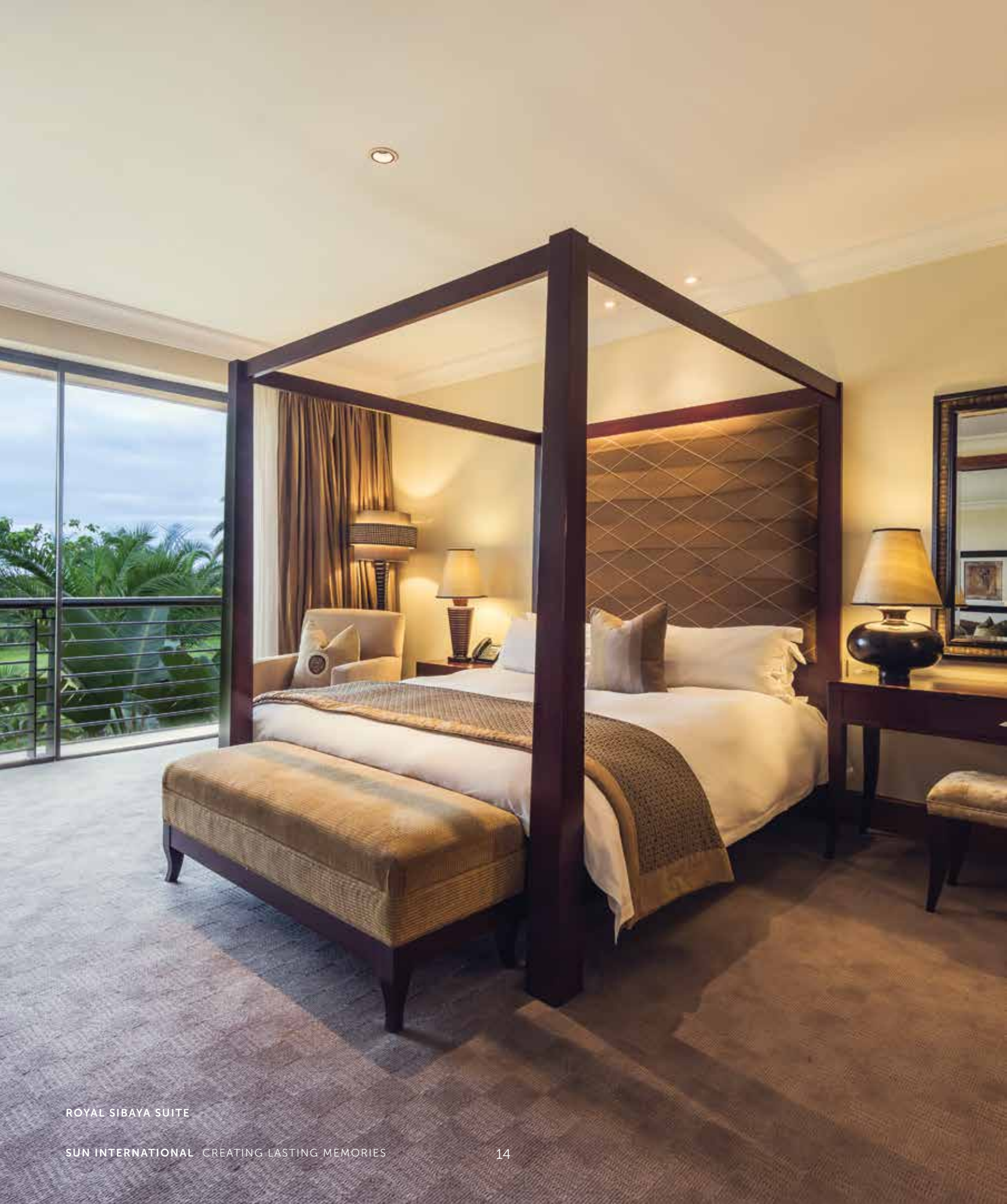
ROYAL SIBAYA SUITE