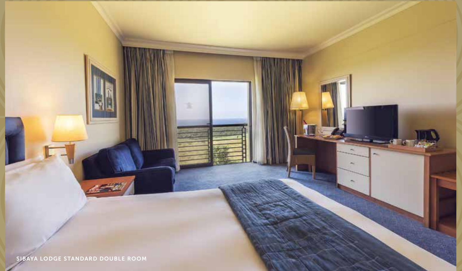
SIBAYA LODGE STANDARD DOUBLE ROOM